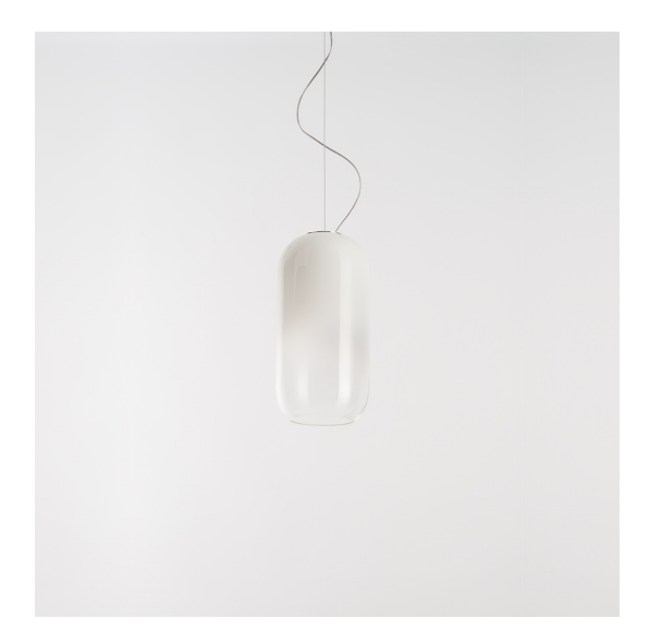
IP 20 (€ Regulable: +0 -