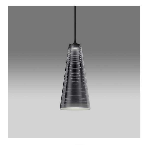
IP20 (=) ( E Regulable: + O-