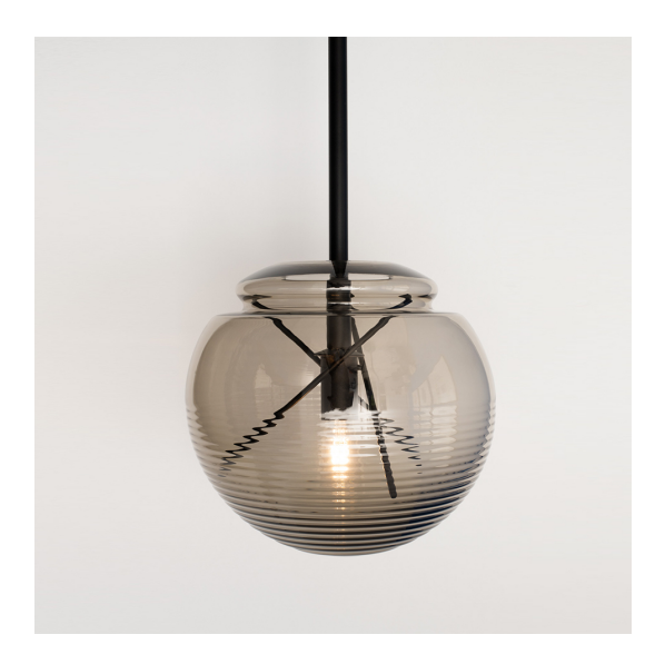
IP 20 ( II )