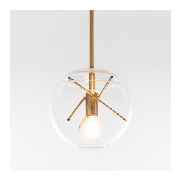
IP 20 ( II )