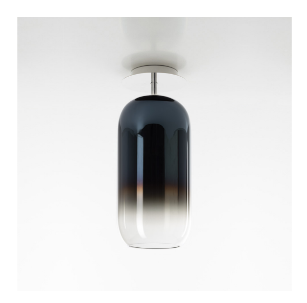
IP20 🖶 🌃 ( E